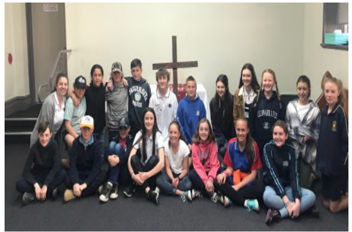
Our Confirmandi with our youth leaders

For further details about the Social Justice Statement, visit the Australian Catholic Social Justice Council website ( www.socialjustice.catholic.org.au ) or call (02) 8306 3499.