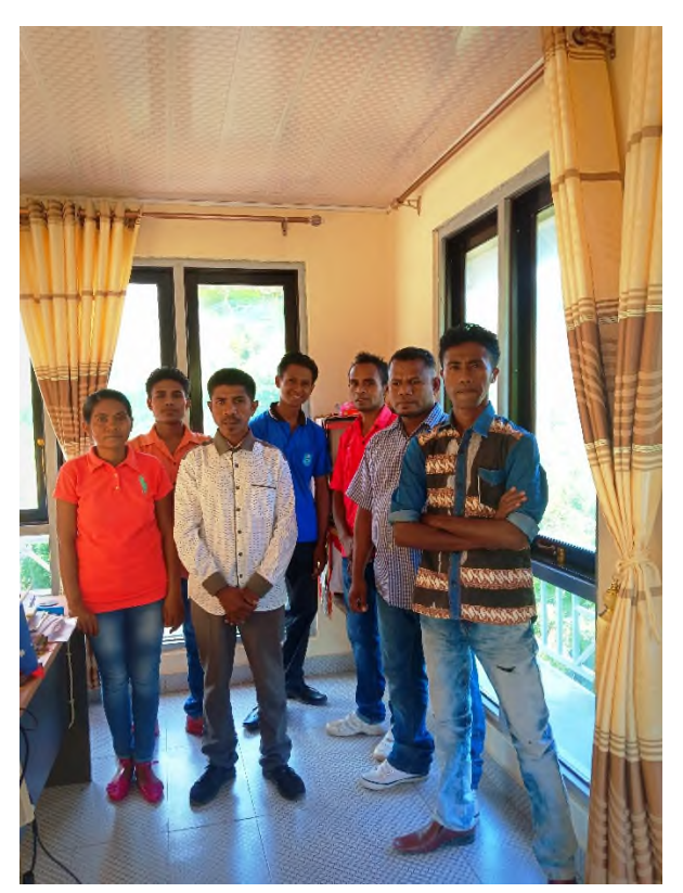
These are some of the people who work for Yass/Gunning Belun in Timor Leste, at our office in Tasitulo, Dili.