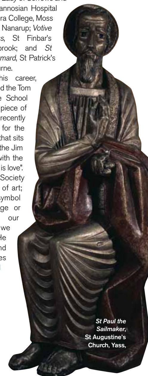
St Paul the Sillmaker, St Augustine's Church, Yass,