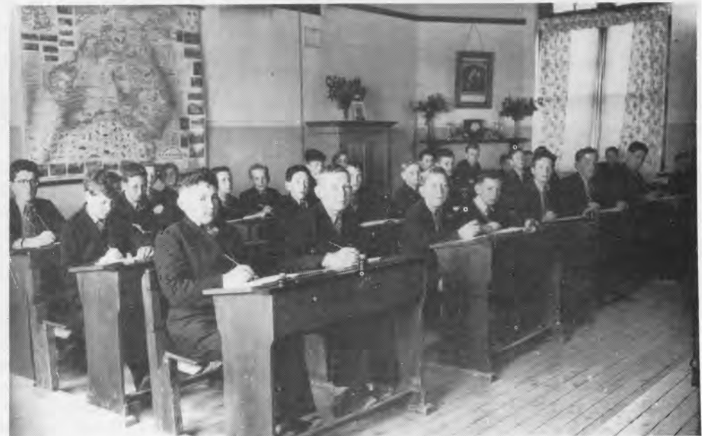
Secondary Boys' School, 1951