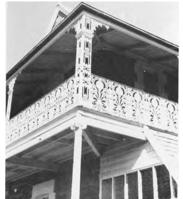
Fine lace work cast iron balconies in Yass

Molly Bawn (Mary Roche) wrote a very fitting Ode, "Blazing The Trail" describing the work done over the completed fifty years.