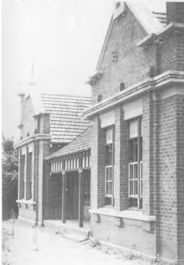
St. Augustine's Boys' School, 1918