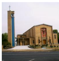
St. Augustine's Church Built 1954

St. Augustine's Yass and St Francis Xavier's, Gunning