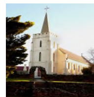
Original St. Augustine's Church - The Lovat Chapel