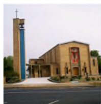
St. Augustine's Church Built 1954

St. Augustine's Yass and St Francis Xavier's, Gunning