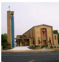
St. Augustine's Church Built 1954

Ph: (02) 6226 1086 E-mail: yass@cg.org.au Website: www.staug-yass.org.au