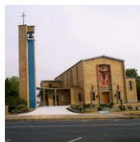
St. Augustine's Church Built 1954

St. Augustine's Yass and St Francis Xavier's, Gunning