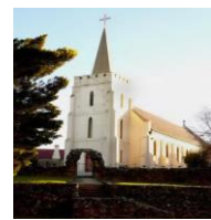
Original St. Augustine's Church - The Lovat Chapel