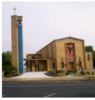
St. Augustine's Church Built 1954

St. Augustine's Yass and St. Francis Xavier's, Gunning