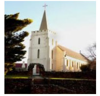
Original St. Augustine's Church - The Lovat Chapel

St Augustine's Parish is a community striving to be Christ to one another and to welcome and serve the Christ in those around us. We seek ongoing spiritual formation as individuals, as families and as a community. We hope, through pastoral care, to strengthen, support and enrich one another and reach out to others in witness and evangelisation.