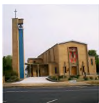
St. Augustine's Church Built 1954

Ph: (02) 6226 1086 E-mail: yass@cg.org.au Website: www.staug-yass.org.au