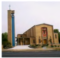
St. Augustine's Church Built 1954