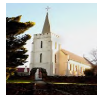
Original St. Augustine's Church - The Lovat Chapel