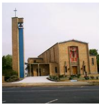
St. Augustine's Church Built 1954

Ph: (02) 6226 1086 E-mail: yass@cg.org.au Website: www.staug-yass.org.au