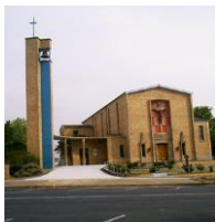
St. Augustine's Church Built 1954

Ph: (02) 6226 1086 E-mail: yass@cg.org.au Website: www.staug-yass.org.au